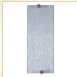
OCP 0250 Cover plate 50 mm