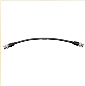
OALC 025 ASI cable 250 mm BNC - BNC