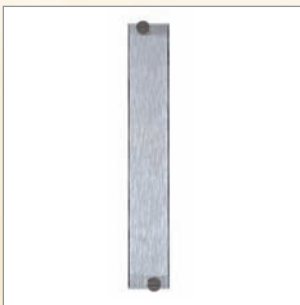
OCP 0220 Cover plate 20 mm