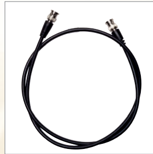
OALC 100 ASI cable 1000 mm BNC - BNC